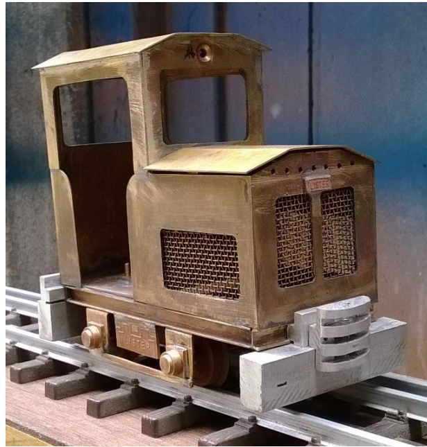
Lister Blackstone RM3 Locomotive Model ( 7/8ths scale )

PLEASE READ THIS OWNERS MANUAL CAREFULLY BEFORE OPERATING THE MODEL